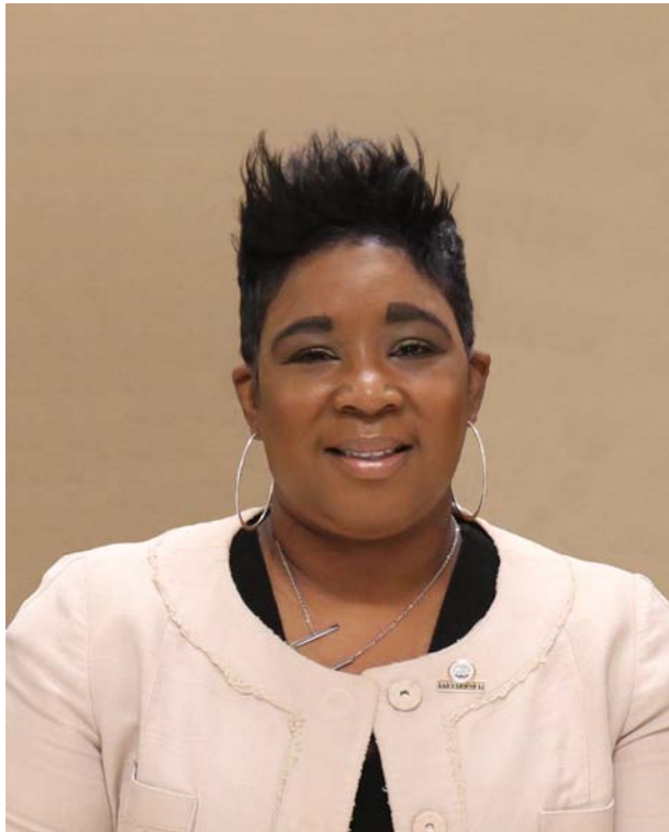
BURLINGTON COUNTY COMMISSIONER FELICIA HOPSON