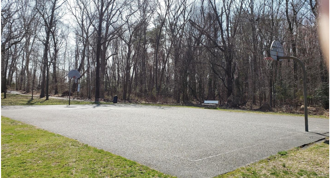
Cliver Park before, and after installation of Sport Court.