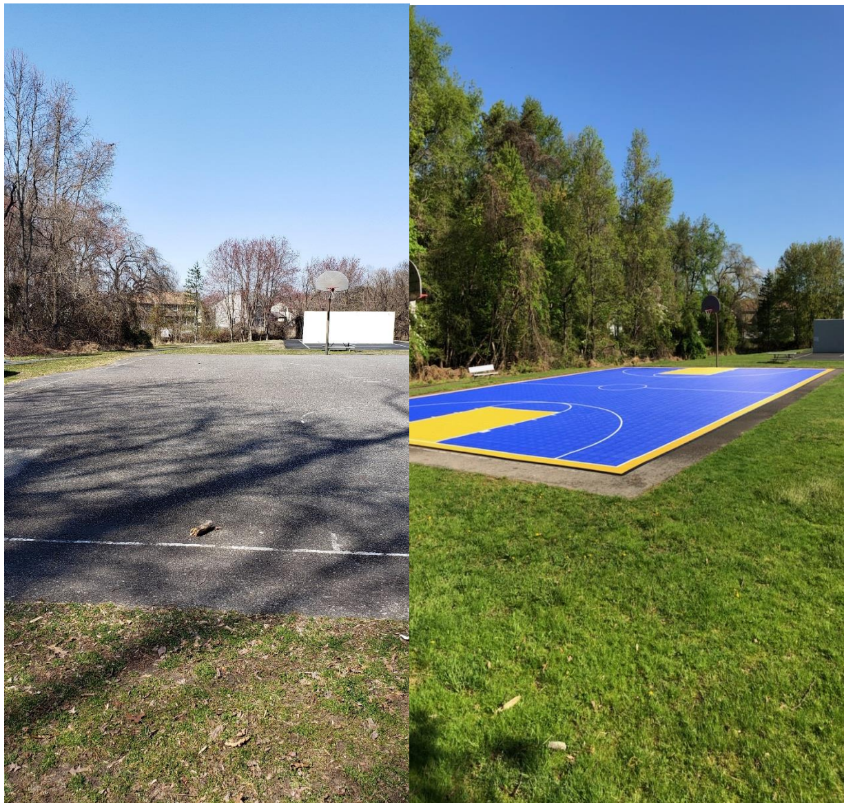
Buttonwood Park before, and after installation of new Sport Court.

Buttonwood Park and Cliver Park basketball courts were resurfaced with Sport Court , a high impact polypropylene tile surfacing. It provides more lateral forgiveness to reduce joint strain and fatigue while allowing for longer play time and increased safety. This improvement was financed by a grant that Eastampton received from the Burlington County Municipal Park Development Program in November 2017. What a huge difference this makes! (We are looking into replacing the hoops as well).